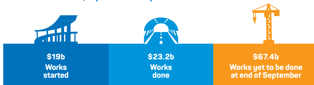
Civil works by activity, September 2020 quarter ($m)