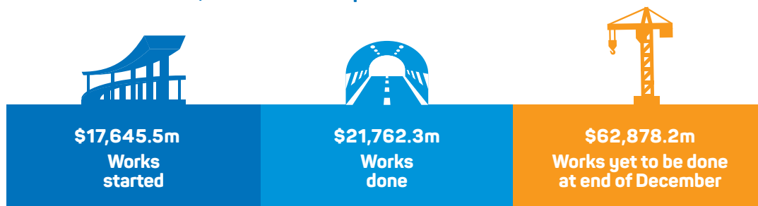
Civil works by activity, December 2020 quarter ($m)