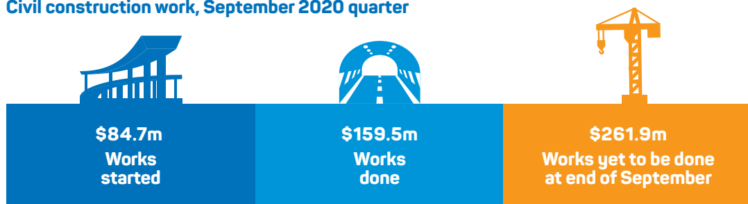
Civil works by activity, September 2020 quarter ($m)