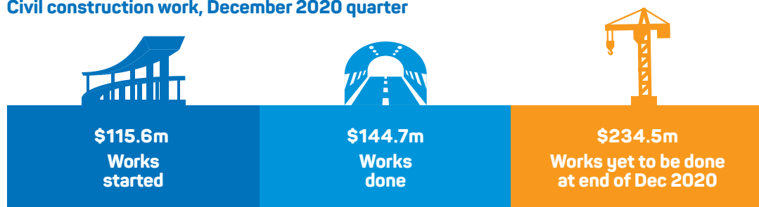
Civil works by activity, December 2020 quarter ($m)