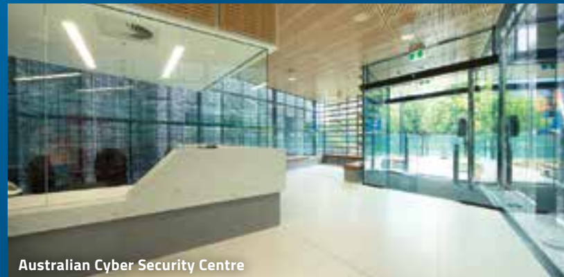
Australian Cyber Security Centre