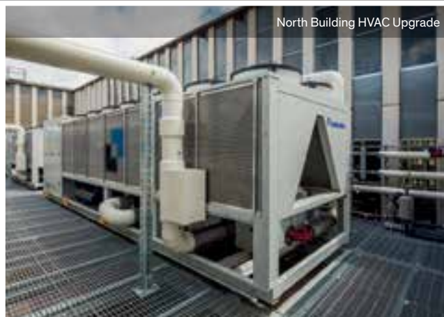
North Building HVAC Upgrade