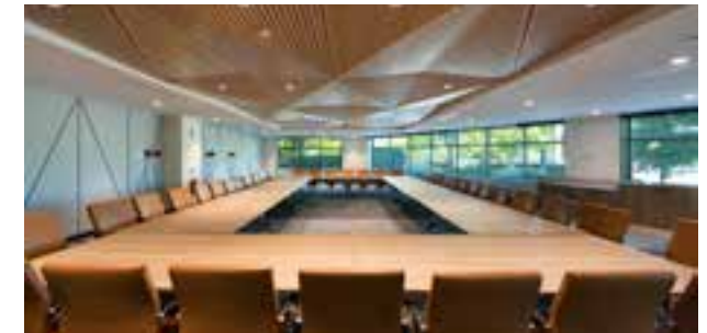
COMMERCIAL FITOUT, REFURBISHMENT OR ALTERATION MORE THAN $5MILLION CONSTRUCTION CONTROL (AUSTRALIA) Australian Cyber Security Centre