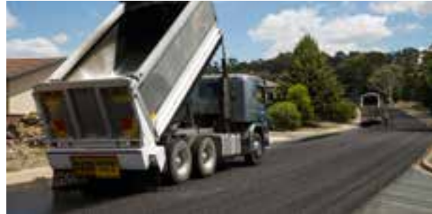
SUSTAINABLE CONSTRUCTION - CIVIL DOWNER EDI WORKS Tonerseal