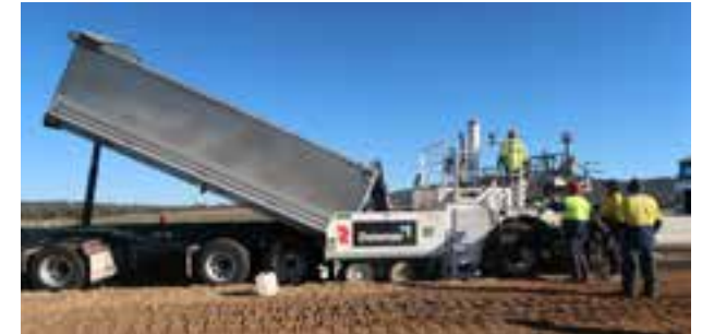
SUSTAINABLE CONSTRUCTION - CIVIL DOWNER EDI WORKS Low Carbon Asphalt incorporating recycled glass