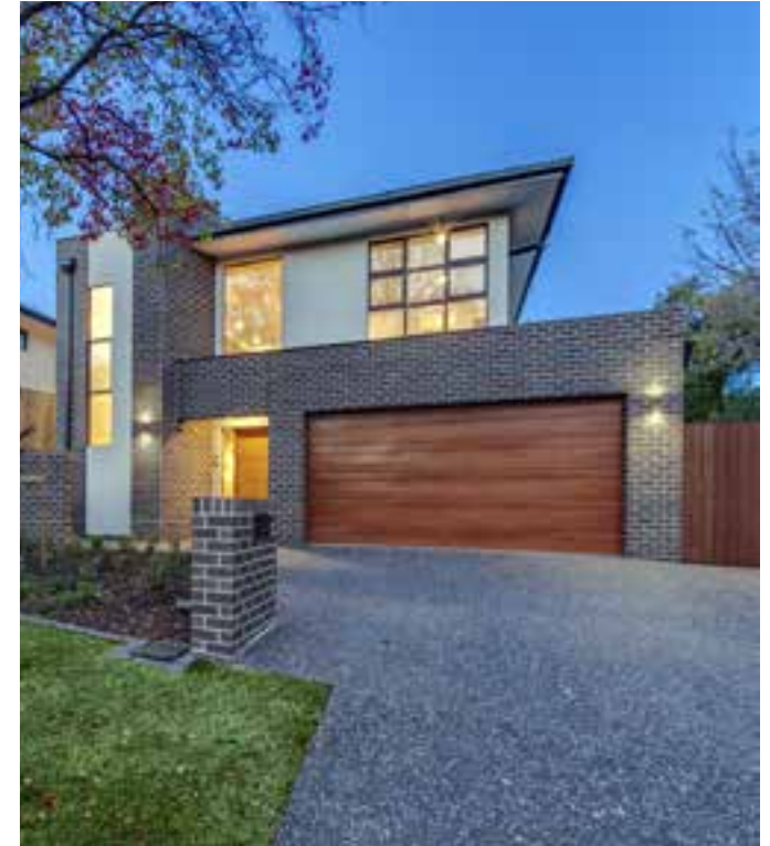
Medium Density - Dual Occupancy, Hughes, ACT