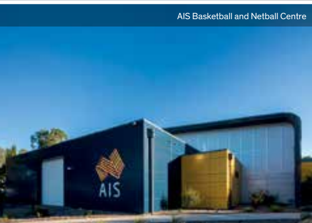
AIS Basketball and Netball Centre