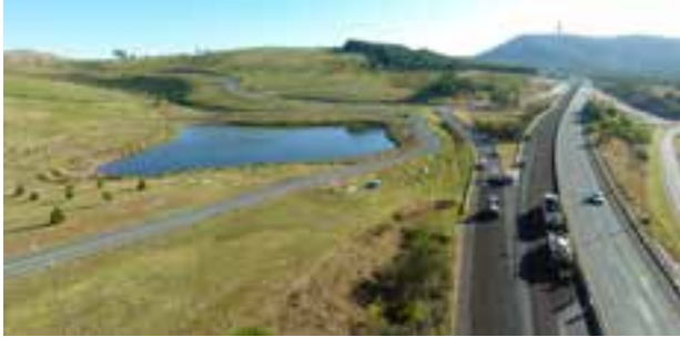
SUSTAINABLE CONSTRUCTION - CIVIL DOWNER EDI WORKS Modified Capeseal