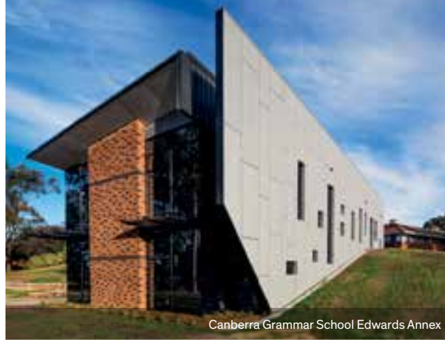
Canberra Grammar School Edwards Annex