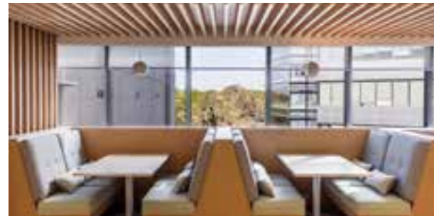
COMMERCIAL FITOUT, REFURBISHMENT OR ALTERATION MORE THAN $5MILLION INTACT PROJECTS CSC Canberra, 7 London Circuit