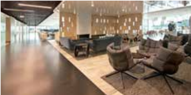
COMMERCIAL FITOUT, REFURBISHMENT OR ALTERATION $1MILLION - $5MILLION CONSTRUCTION CONTROL (AUSTRALIA) Canberra Airport Group Office Fitout