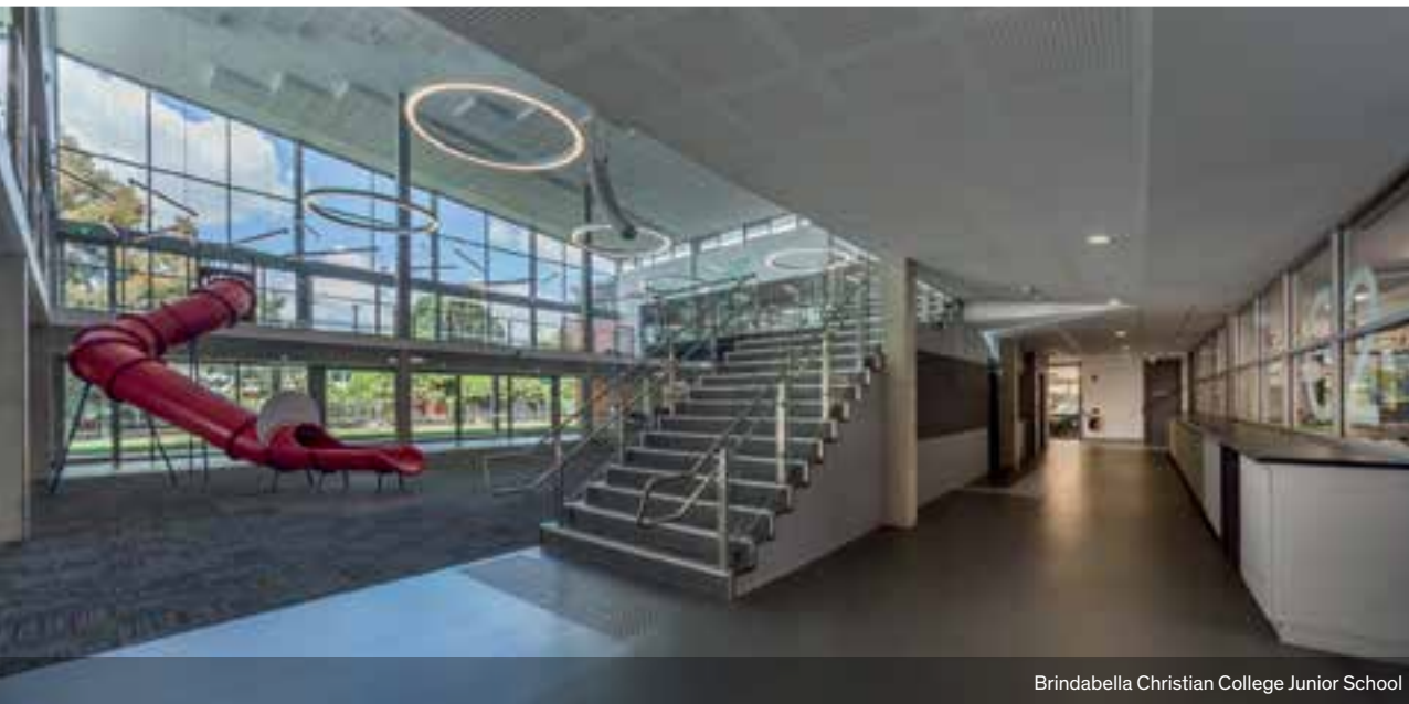
Brindabella Christian College Junior School