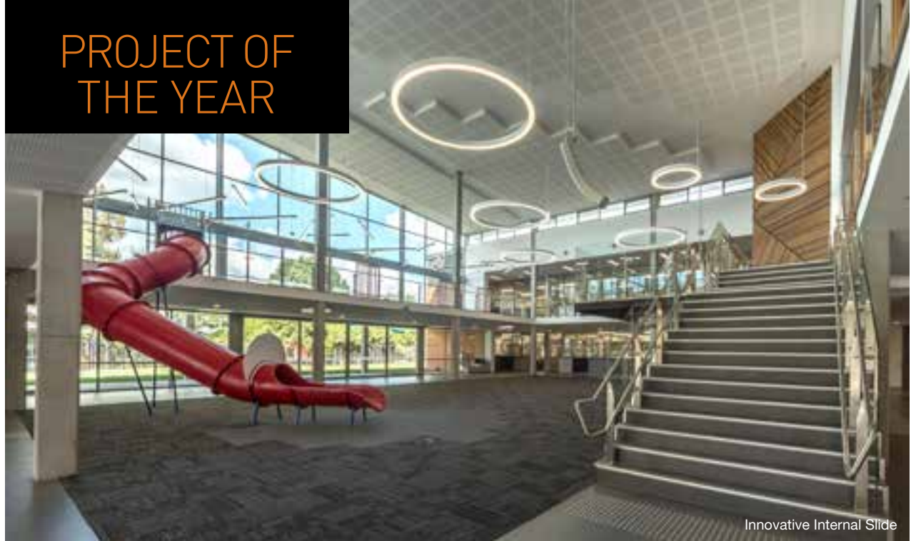
Innovative Internal Slide

Brindabella Christian College, Junior School