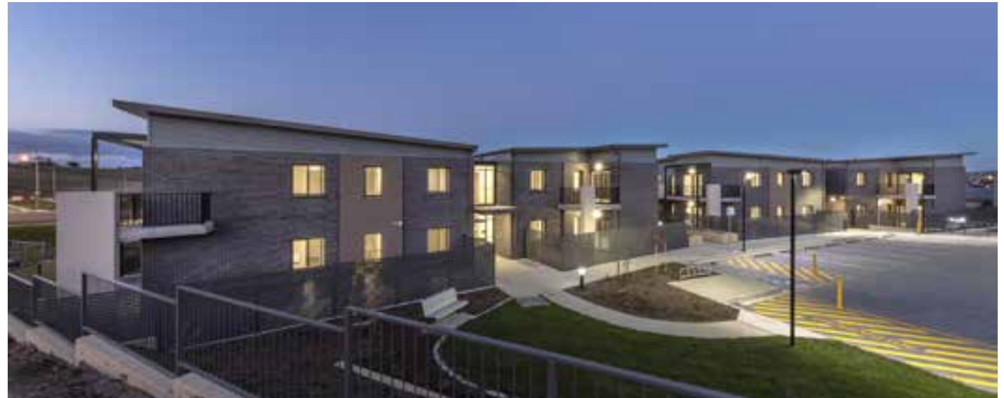
"Bundaberg" Unit Development Moncrieff, ACT