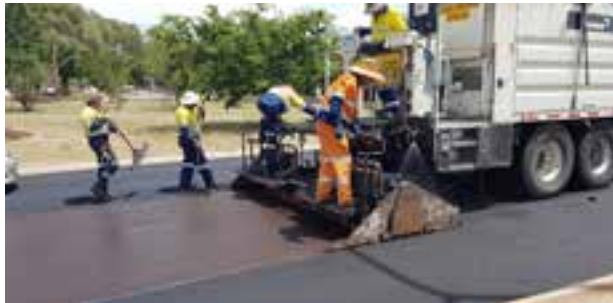
SUSTAINABLE CONSTRUCTION - CIVIL DOWNER EDI WORKS ACT Resealing Contract