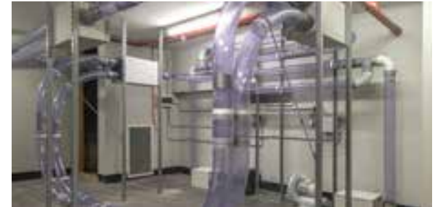
PROJECT EXHIBITING TECHNICAL DIFFICULTY OR INNOVATION SHAW BUILDING GROUP The Canberra Hospital - Essential Services Infrastructure