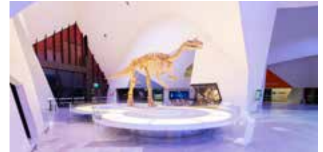
COMMERCIAL FITOUT, REFURBISHMENT OR ALTERATION $1MILLION - $5MILLION BOSS CONSTRUCTIONS (ACT) National Museum of Australia Main Hall Refurbishment