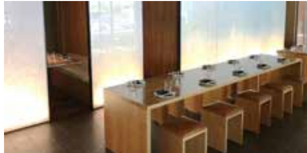
COMMERCIAL FITOUT, REFURBISHMENT OR ALTERATION $1MILLION - $5MILLION BLACKETT COMMERCIAL Raku