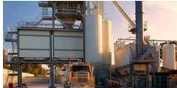
SUSTAINABLE CONSTRUCTION - CIVIL DOWNER EDI WORKS Coldmix Asphalt (using high flash point cutter)