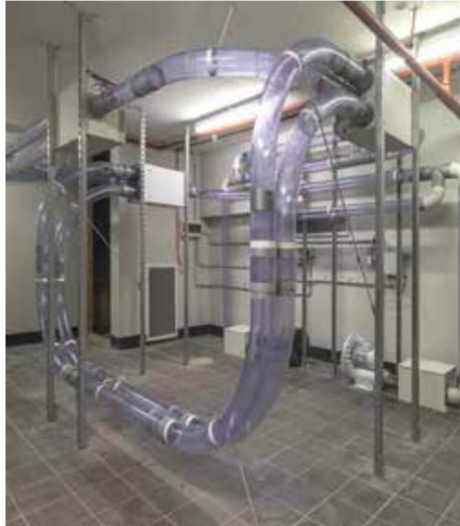
The Canberra Hospital - Essential Services Infrastructure