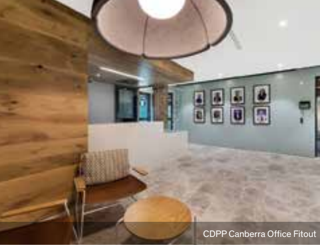
CDPP Canberra Office Fitout