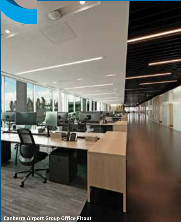
Canberra Airport Group Office Fitout

OUTSTANDING PEOPLE » OUTSTANDING PROJECTS » CONTROL.COM.AU